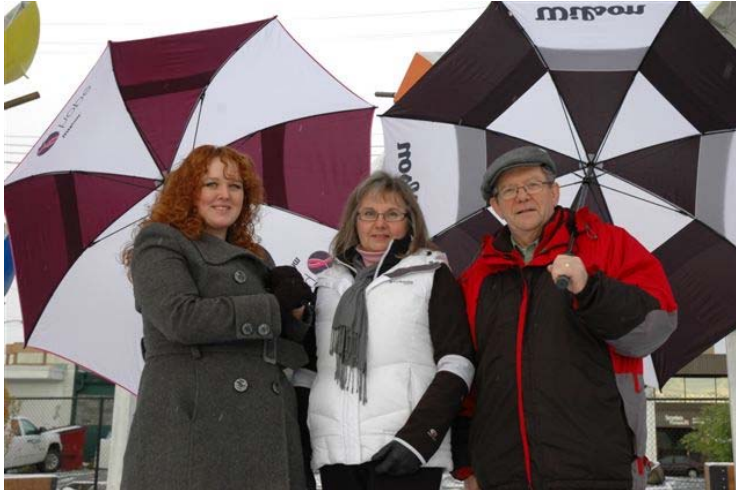
Greater Terrace Beautification Society volunteers at Brolly Square