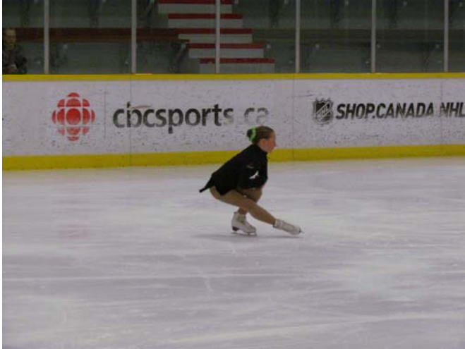
Figure skating and minor hockey clubs had similar participation numbers to previous seasons. Figure skating had 131 registrants and minor hockey had 373 registrants. Smaller clubs like ringette had 46 registrants and speed skating had 20.

week and totalled 2208 attendees. The free Monday public skates were well utilized with an additional 1323 attendees.