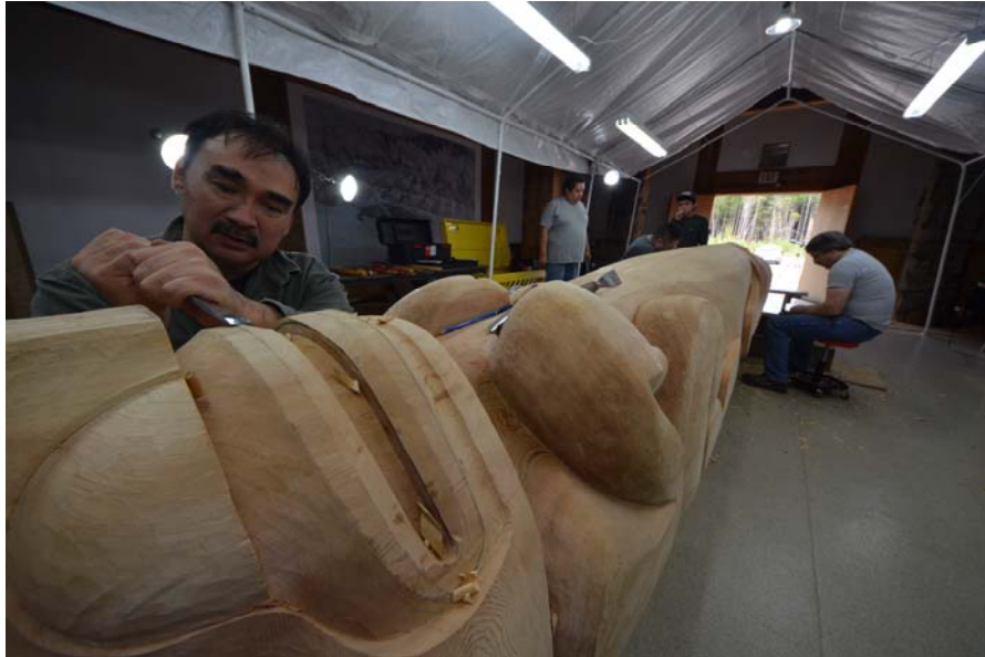
Carving shed at Kitselas Canyon