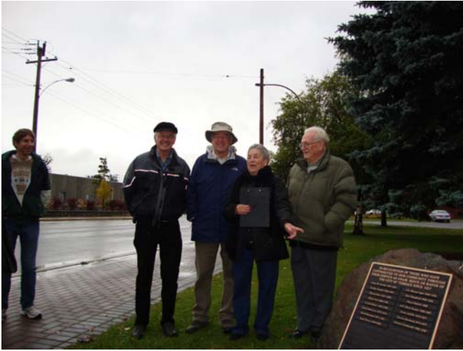
A plaque to recognize the contributions of the former mayors of Terrace was unveiled