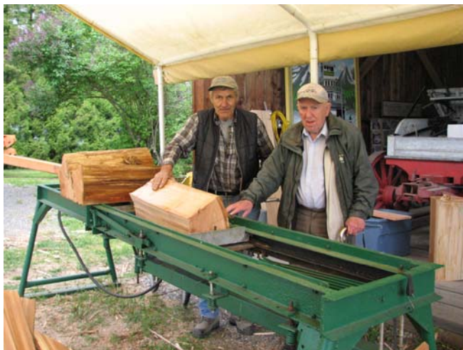
Cedar shake splitting at Heritage Park