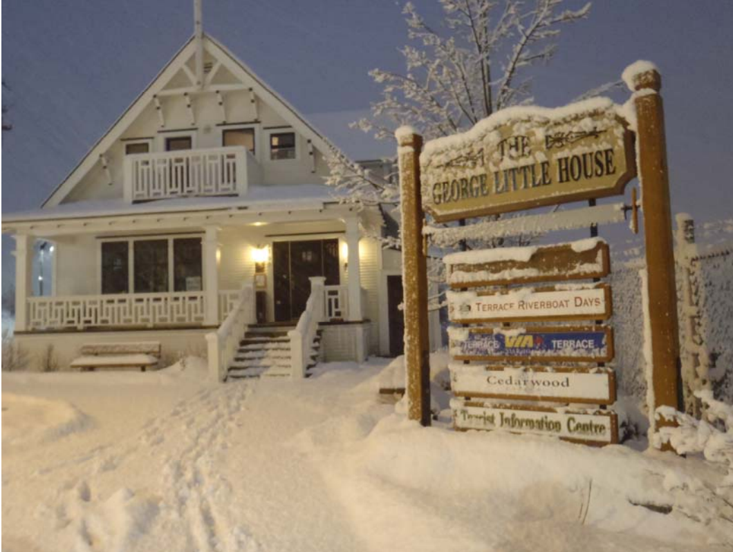
George Little House