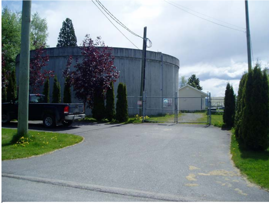
Wilson Street Pump House