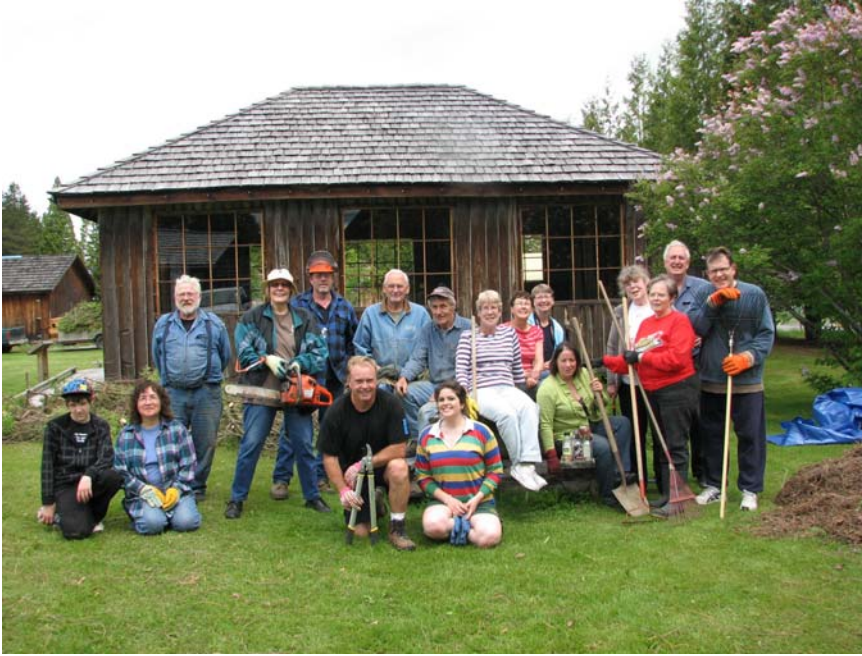
Volunteers at Heritage Park Museum