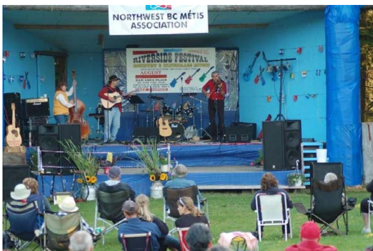
Riverside Festival 2011