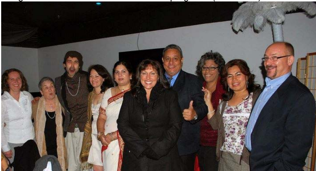
Award winners at the 2011 Terrace and District Chamber of Commerce Business Excellence Awards