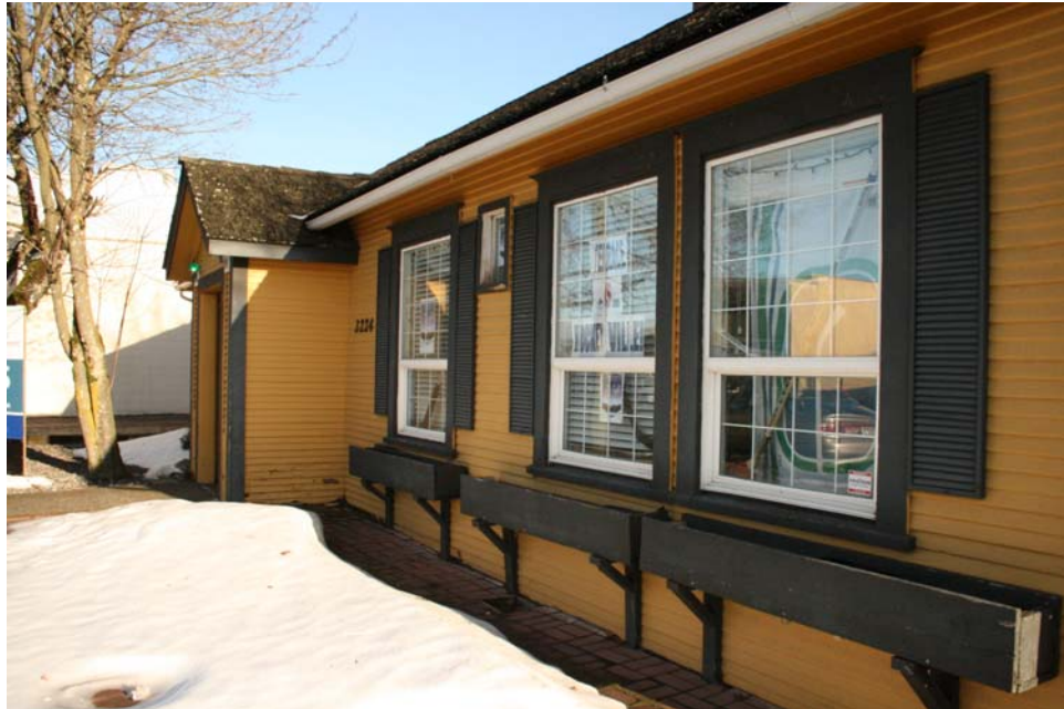
Terrace Economic Development Authority