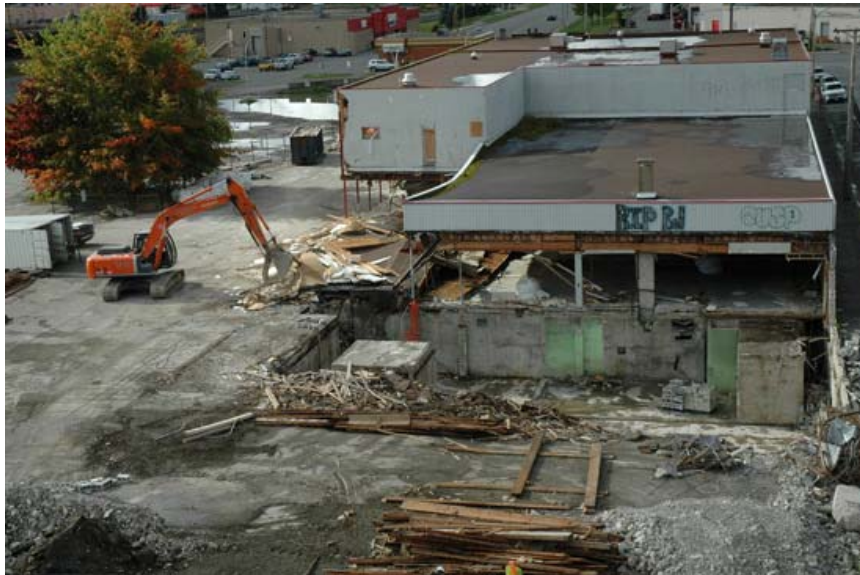
Demolition of Co-op Building

Projects to further the development potential of City owned land included environmental investigations on the 20 acre Keith Avenue and former Co-op properties, the purchase of 94 hectares of future industrial land from the Crown within the Skeena Industrial Development Park (SIDP) and Highway 37 Intersection and Industrial Way detailed road design.