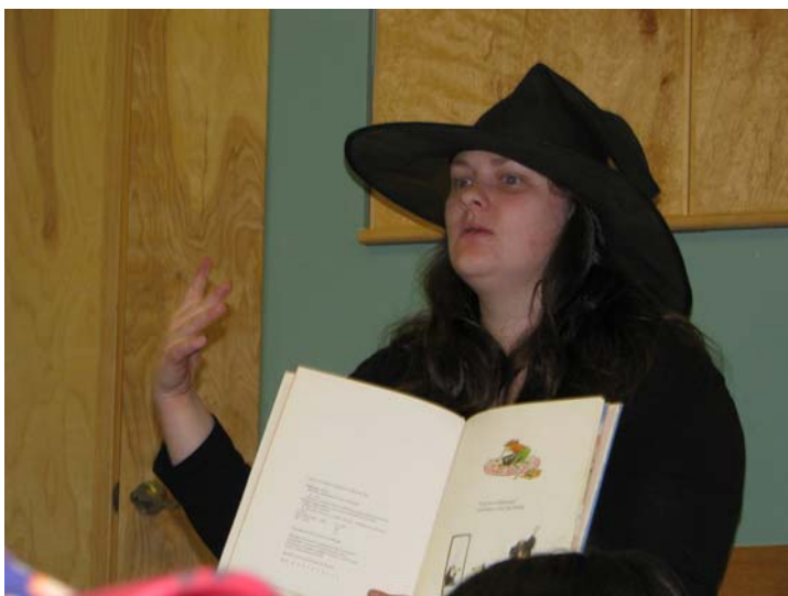
Storytime at the Terrace Public Library