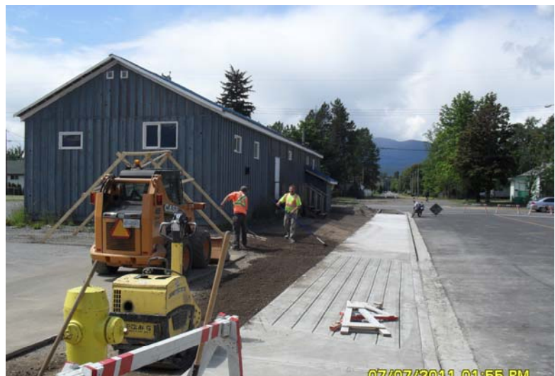
Rebuild of Davis Avenue

The Sustainability Division passed a bylaw to regulate the use of pesticides for non-essential purposes within the municipality and supported the creation and development of a local food security organization, the Greater Terrace Food Association. To further support our local food security goals amendments were adopted to the Animal Control Bylaw to allow for backyard hens in all residential zones. A variety of sustainability initiatives were carried out to support the GHG emissions reductions targets established in the updated OCP including home energy audit incentives, implementation of the Active Transportation Plan and promoting education such as the "Climate Action Showdown" program in elementary classrooms.