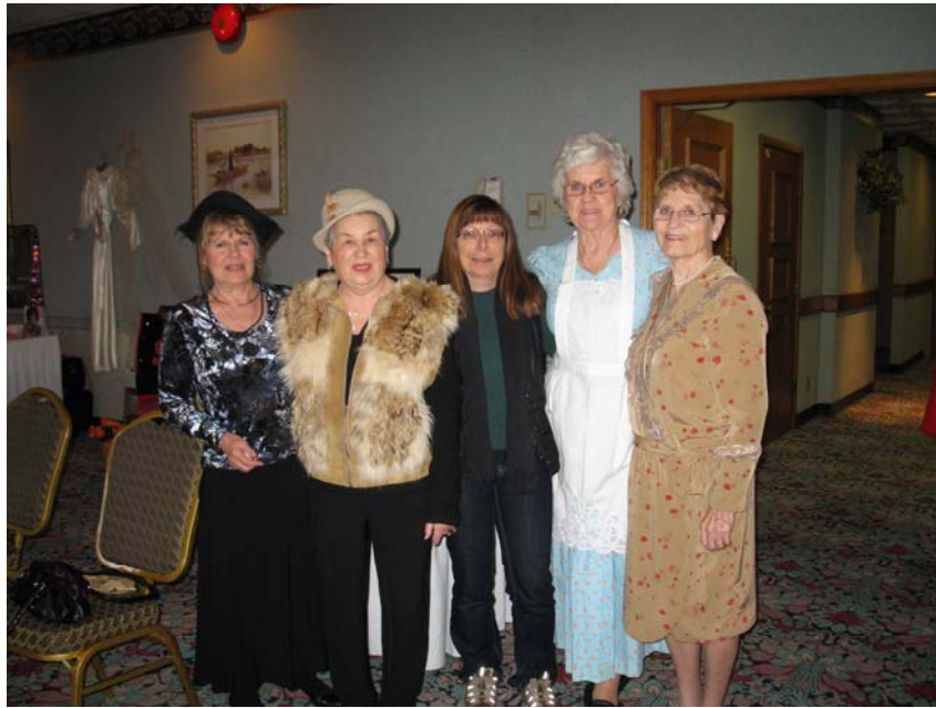
At the 2011 Vintage Fashion Show