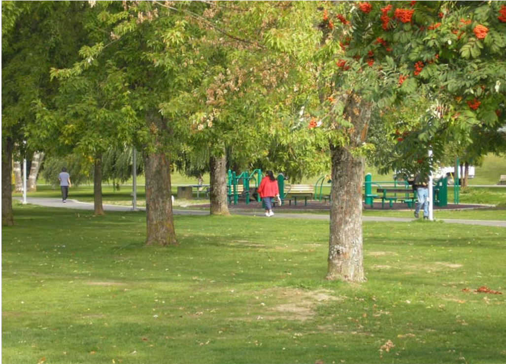
George Little Park