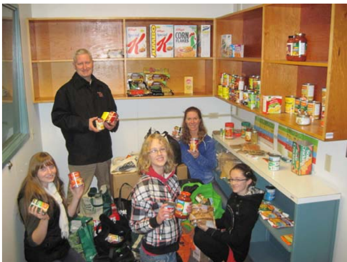
The Youth Advisory Committee collected items for the NWCC Students' Food Bank at Hallowe'en