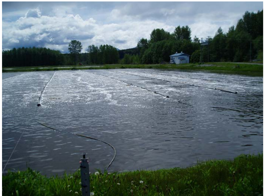
Sewage Treatment Lagoons

At the Sewer Treatment Plant, paving around the wet well area, and sediment removal system upgrades helped improve operations, and de-sludging of the lagoons improved the effectiveness of the sewage treatment process.