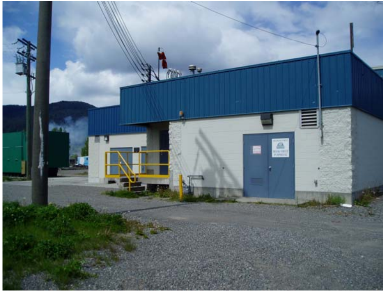
Frank Street Well

The Public Works Department is responsible for the operation and maintenance of the City's infrastructure as well as construction of specific capital works projects. The areas of responsibility include: streets and sidewalks, snow removal and sanding, sanitary sewer collection and treatment, storm water collection, potable water supply and distribution, garbage collection, composting, purchasing, buildings, and municipal fleet vehicles.