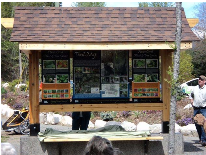
At the Grand Opening of the Howe Creek trail extension