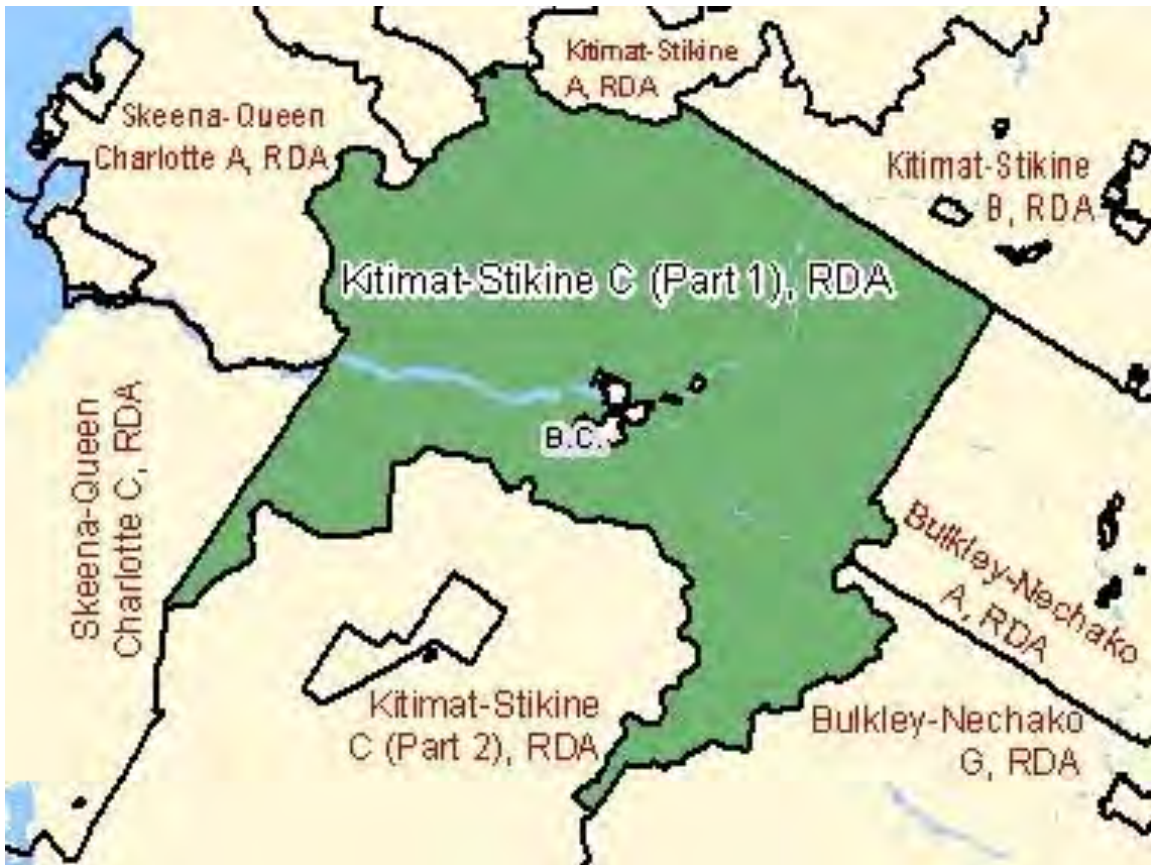
FIGURE 2 – REGIONAL DISTRICT OF KITIMAT-STIKINE C PART 1

Census of Agriculture information for GT is only available in 2011. The Census of Agriculture does not refer to GT per se and the Census of Agriculture boundaries for what is termed as GT in Appendix I tables reporting Census of Agriculture information do not exactly correspond to the boundaries described in Chapter 1, but are their closest approximation. More specifically, 2011 Census of Agriculture information used for GT consists of all of the area included within the boundaries of the Regional District of Kitimat-Stikine C part 1. This area is depicted in Figure 2. The areas in white within the green areas are included .