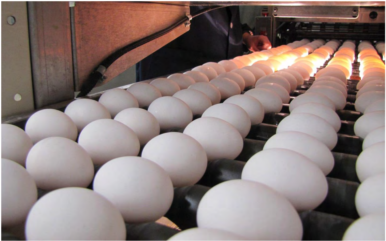
Photos: Free-run hens and eggs grading